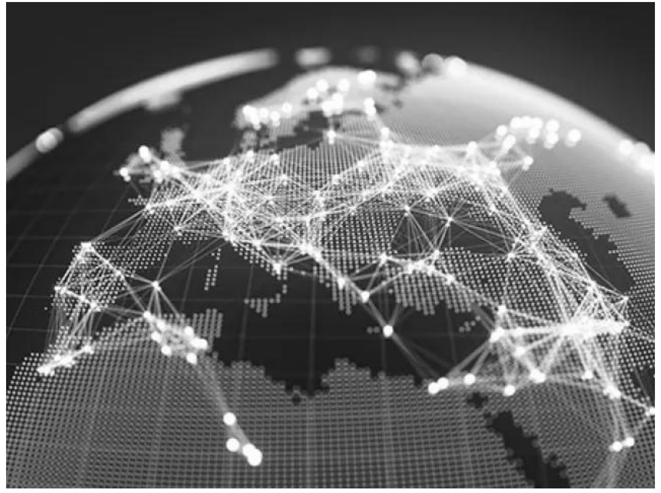
Special Episode: Roddy Martin on the 5 Stages of Supply Chain Transformation

Learn about the 5-stage journey to supply chain transformation—and the challenges you're likely to face along the way. View More