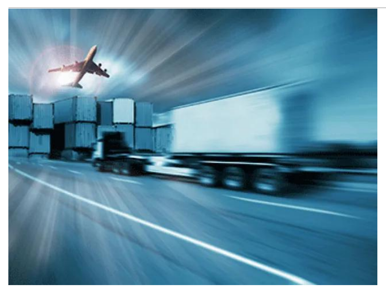
No More Serialization Surprises: Proactive Monitoring with Serialized Product Intelligence

Learn how Serialized Product Intelligence gives you visibility into your serialized operations, so can respond to data requests and resolve issues quickly. View More