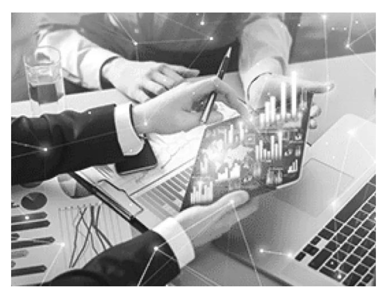
How Does Serialized Product Intelligence Enable Root Cause Analysis of Compliance Errors?

Watch this product demo to see how Serialized Product Intelligence empowers serialized operations teams with self-service troubleshooting capabilities.