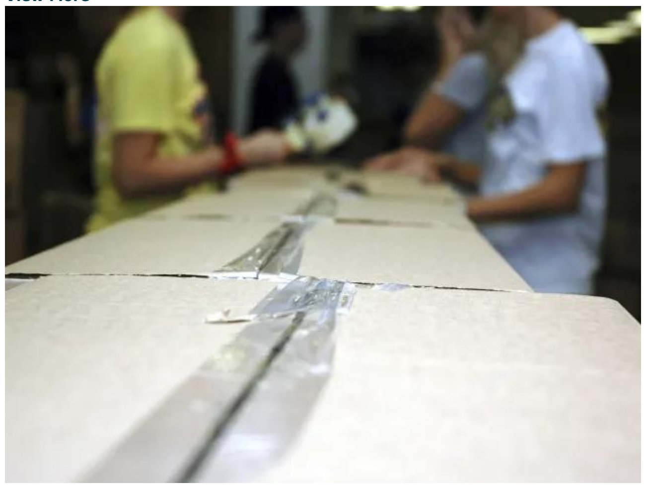
Resolve Supply Disruptions Fast with Serialized Product Intelligence

Shipment delayed due to serialization exceptions? Learn how TraceLink can help. View More