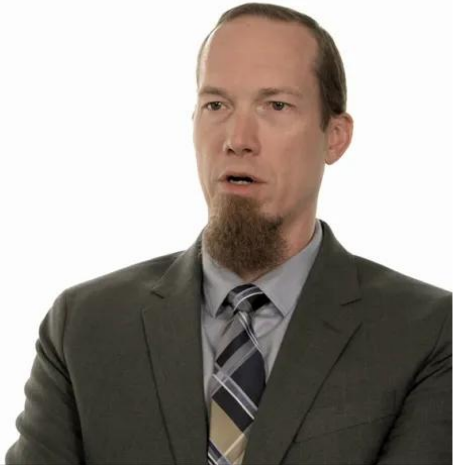
Sheldon Service Products