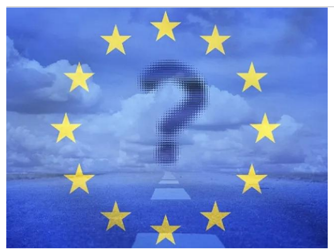
What Are the 3 Major Requirements of EU FMD?

The EU Falsified Medicines Directive contains requirements for safety features and verification that details how companies must establish serialization and reporting. View More