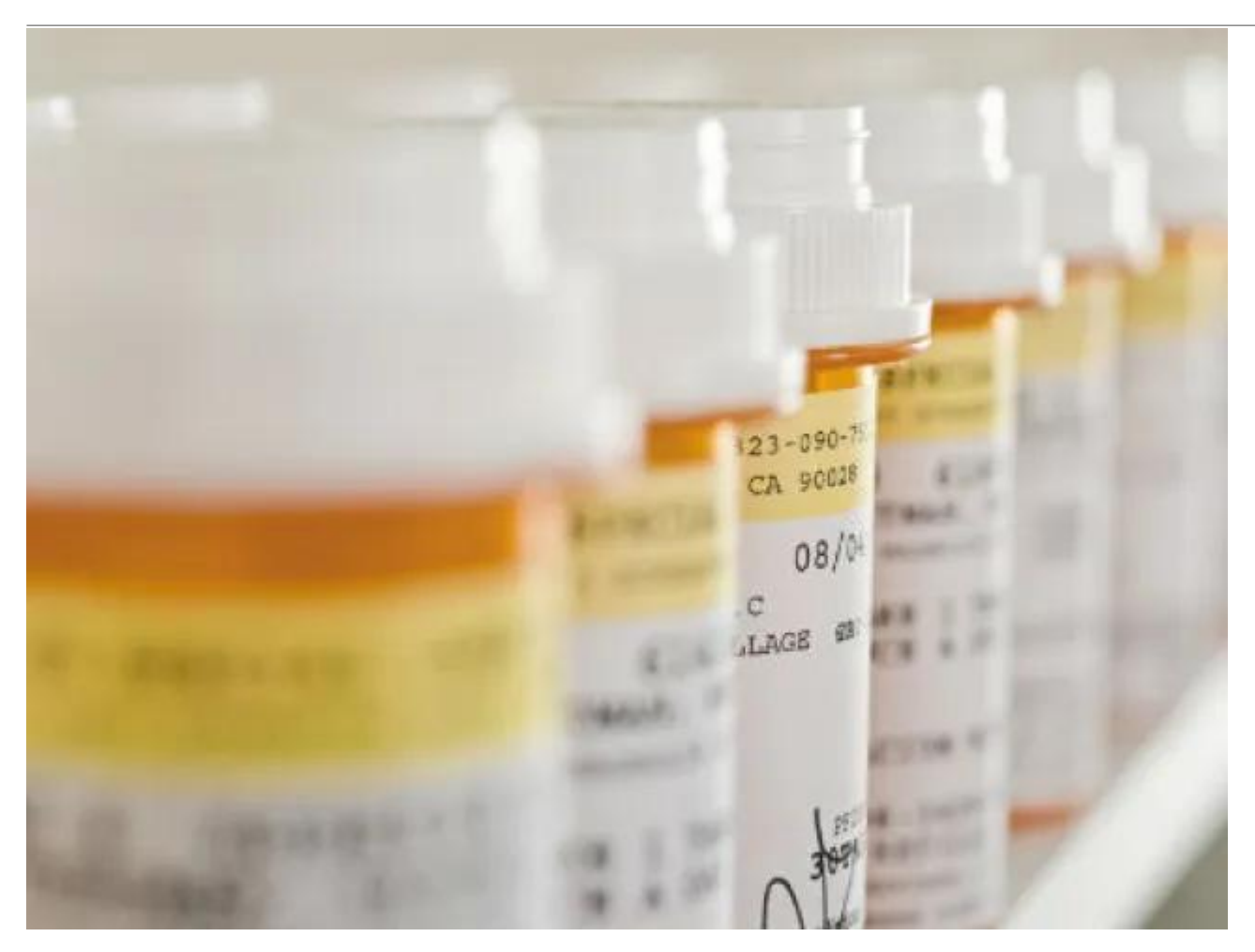
How Serialization Empowers Health Systems to Improve Patient Care

Find out how the right approach to DSCSA compliance and serialization can lead directly to better patient outcomes.