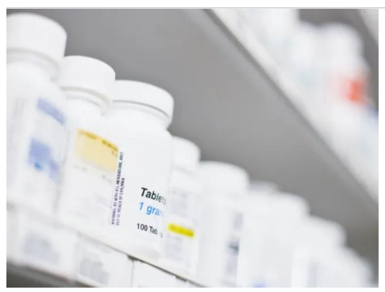
DSCSA and the Path to Supply Chain Transformation for Retail Pharmacies

DSCSA isn't just a requirement for your retail pharmacy, it's an opportunity. Watch this supply chain transformation video to find out why. View More