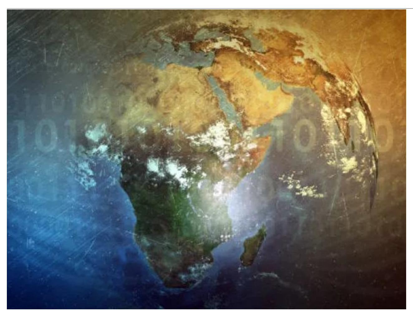
Saudi Arabia: Understanding the Compliance Requirements

Download this infographic for an overview of Saudi reporting requirements, key deadlines, roles and responsibilities, packaging elements, and more.