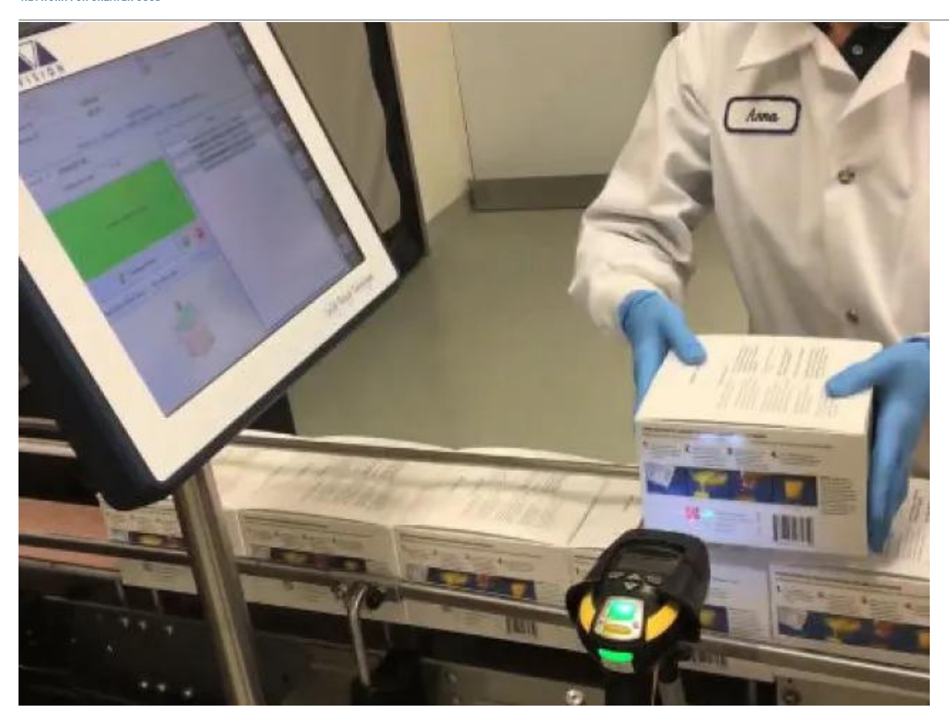
AVM Helps Virtual Manufacturer Automate Software Validation Across Diverse Supply Chain

Read how a leading biopharmaceutical manufacturer turned to TraceLink's Automated Validation Manager to help manage software compliance.