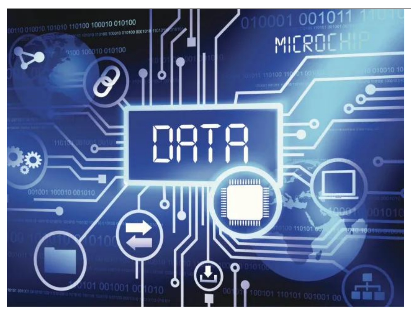
Four Reasons Why Pharma Companies Need a Serialization Intelligence Solution

Pharmaceutical companies need real-time visibility into operations, people, and systems across serialization infrastructures. See the reasons why.