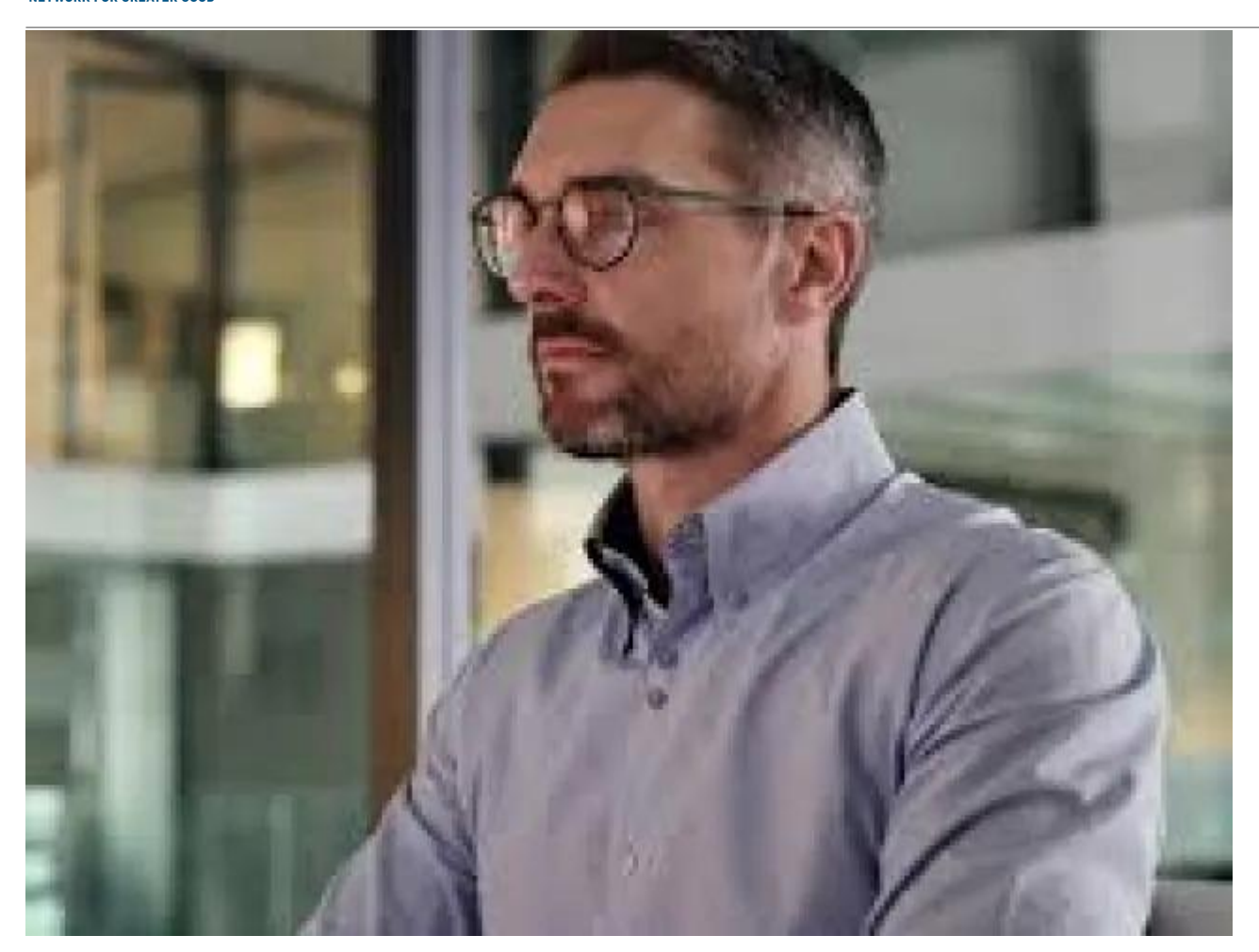
Accelerate Serialized Operations with Serialized Product Intelligence

Serialized Product Intelligence lets you proactively search, filter, and analyze serialization data and drill down to quickly pinpoint potential problems.