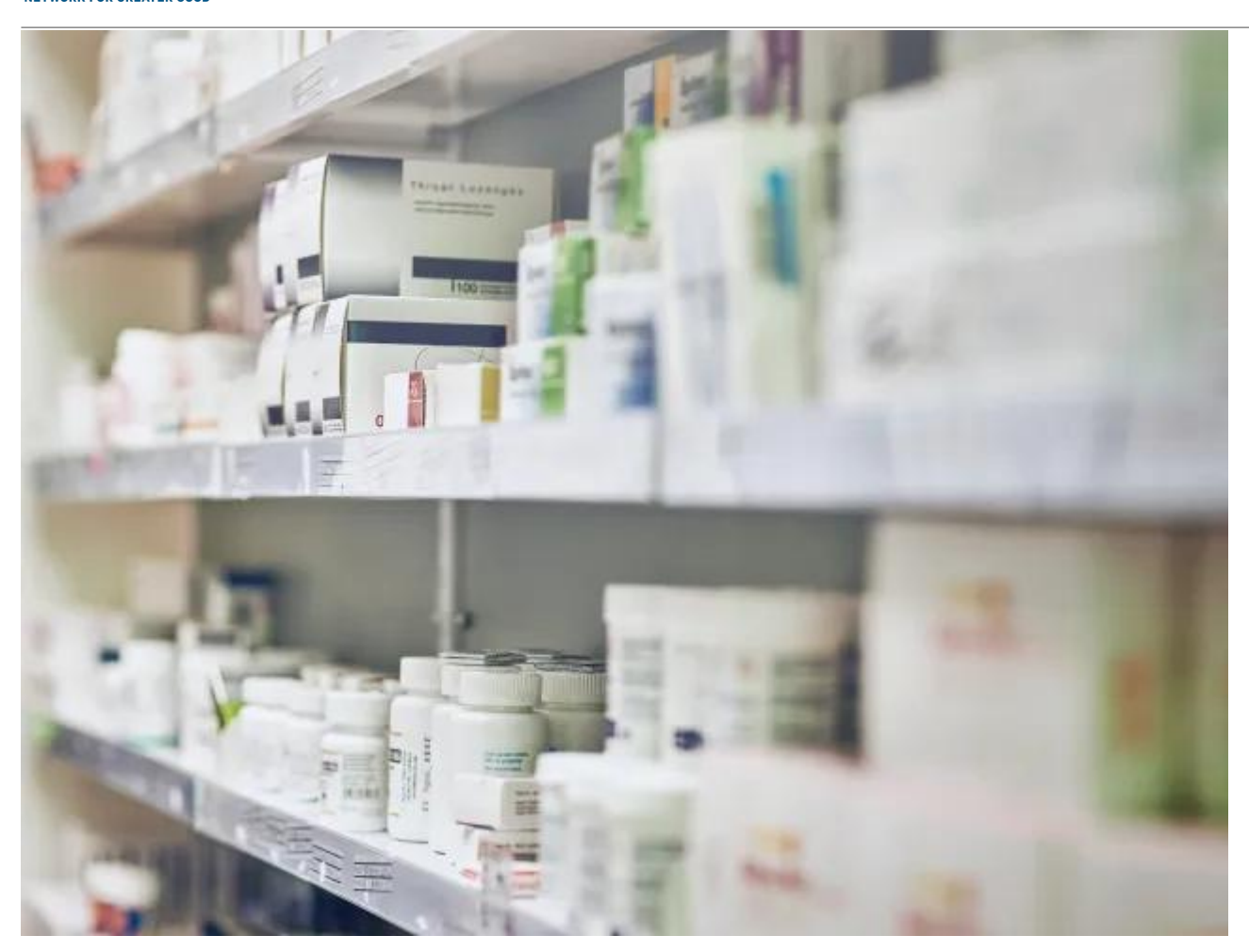
3 Scenarios: How Suspect Products Enter the Pharmaceutical Supply Chain

Learn what health systems and retail pharmacies need to do if they determine that a product is suspect.