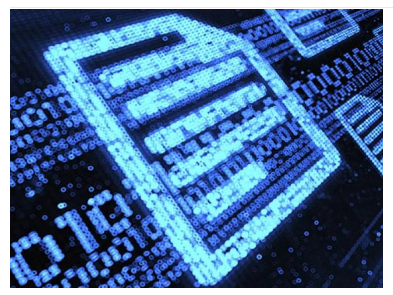
Digital Information Sharing: Master Data and Verification

Easily share master data with your trading partners and enable DSCSA saleable returns verification with TraceLink's digital sharing platform.