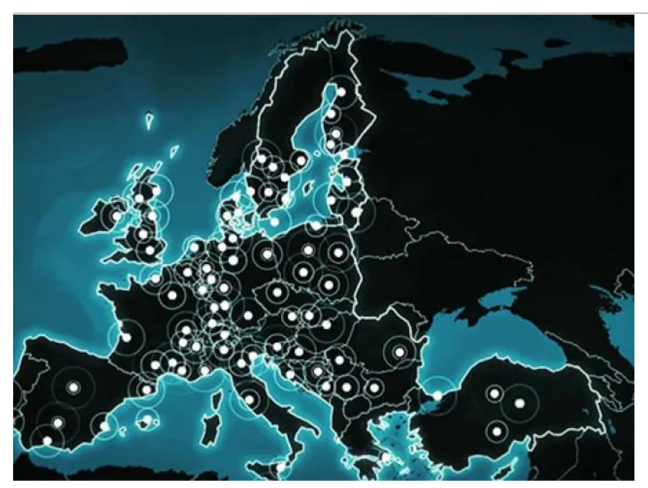
EU FMD, Distribution, and Decommissioning: Top Questions Answered

Learn the answers to seven decommissioning questions surrounding EU FMD and warehouses.