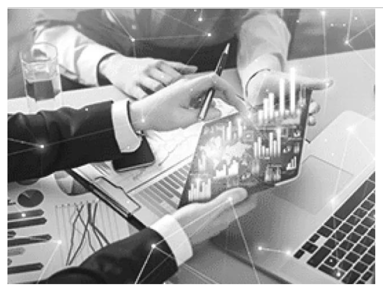
How Does Serialized Product Intelligence Enable Root Cause Analysis of Compliance Errors?

Watch this product demo to see how Serialized Product Intelligence empowers serialized operations teams with self-service troubleshooting capabilities.