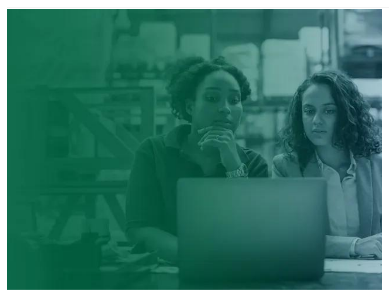
Reconciling Digital Information with Physical Events with SPI

Learn how companies can review serialized events to see if digital records match the physical status of a product.