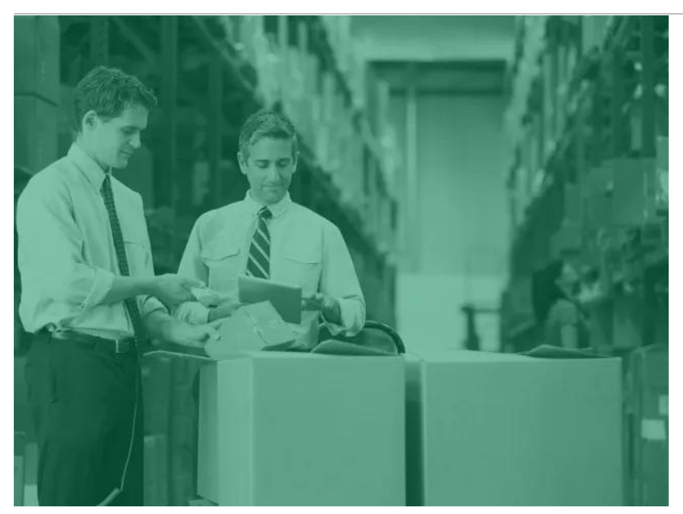
Global Visibility into Product Commissioning and Aggregation with SPI

Learn how companies can use Serialized Product Intelligence to track products across multiple geographies and compliance mandates.