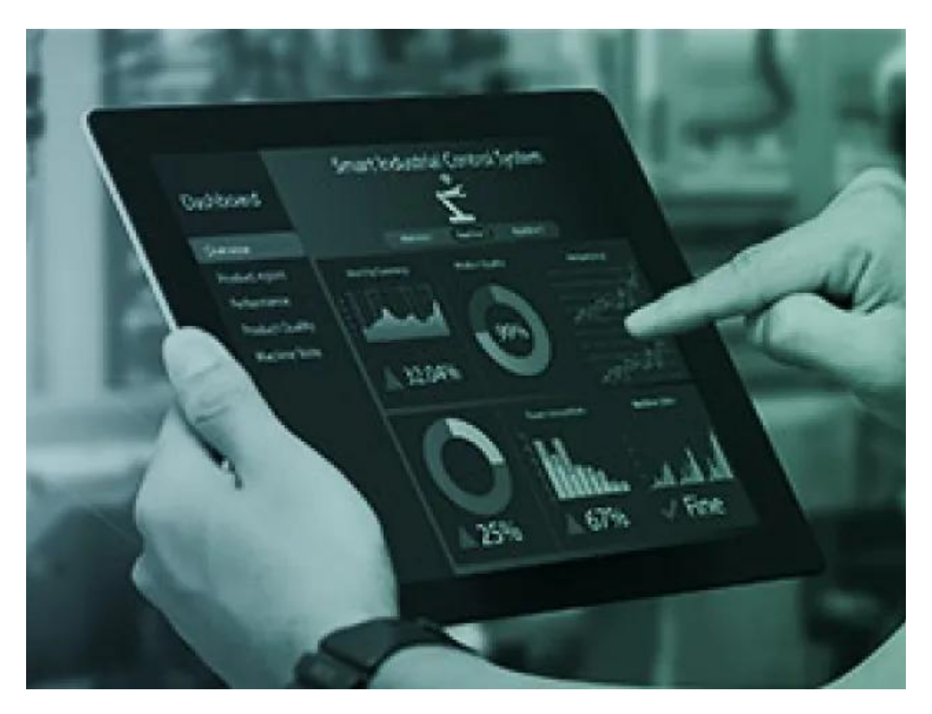
The Proactive Contract Manufacturer: Improve Customer Service and Free Up Capacity with Serialized Product Intelligence

Serialized Product Intelligence, a commercial analytics application from TraceLink. View More