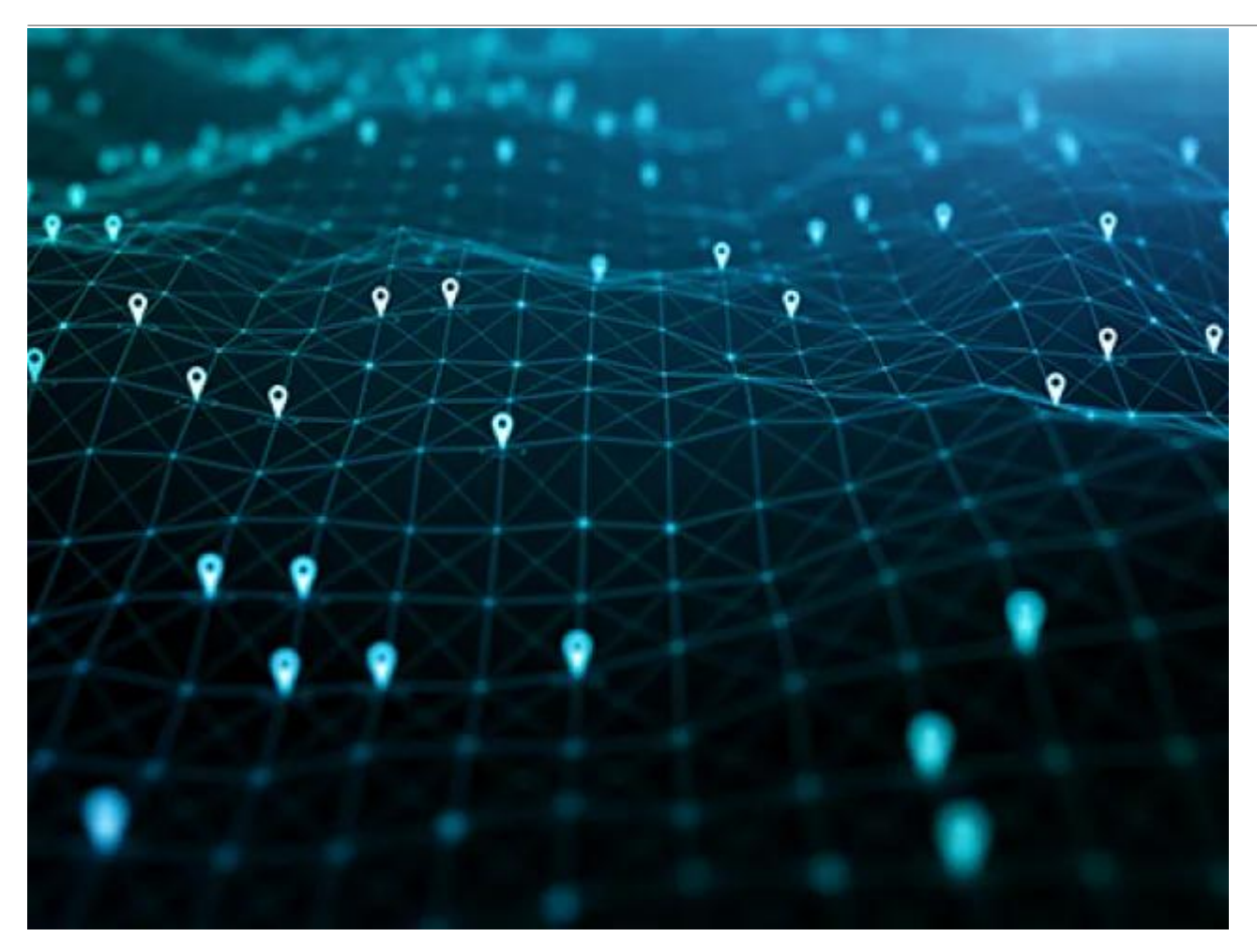
TraceLink Announces Multiple Achievements in the Development of Opus™, the Operating Platform for Industry 4.0

TraceLink Inc, the leading digital network platform company, made a series of announcements today that highlight the progress being made in the development of Opus, the operating platform for Industry 4.0.