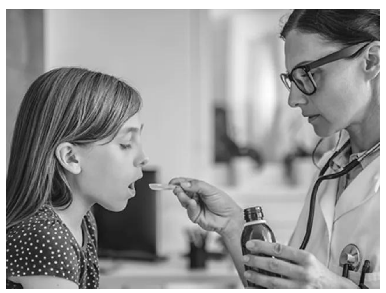
DSCSA 2023 for Health Systems and Pharmacies: 50 Essential Terms

These 50 terms will help pharmacies and health systems understand important DSCSA concepts as they prepare for the 2023 deadline.