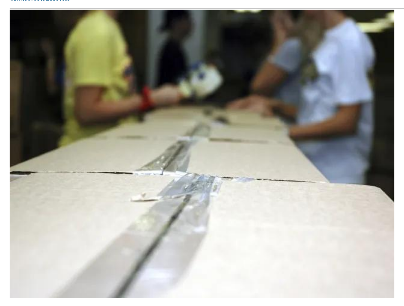
Resolve Supply Disruptions Fast with Serialized Product Intelligence

Shipment delayed due to serialization exceptions? Learn how TraceLink can help. View More