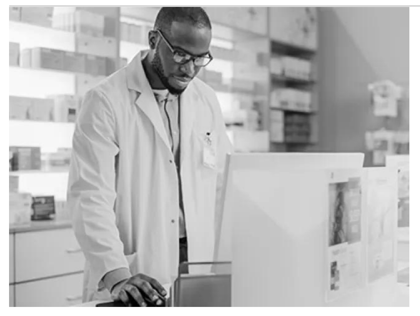
How To Ensure Drug Supply and Create Business Value with DSCSA Compliance

How to Ensure Drug Supply and Create Business Value with DSCSA Compliance: The Definitive Guide for Health Systems and Pharmacies View More