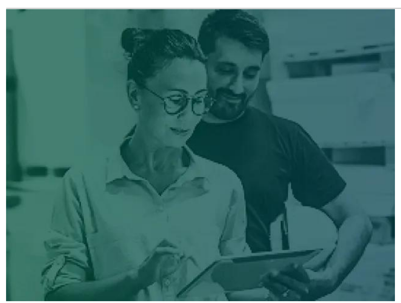
DSCSA 2023: Requirements and Implementation Strategies for Dispensers

The final phase of the Drug Supply Chain and Security Act (DSCSA) introduces new requirements for dispensers, including all-electronic, interoperable item-level traceability for medicines.