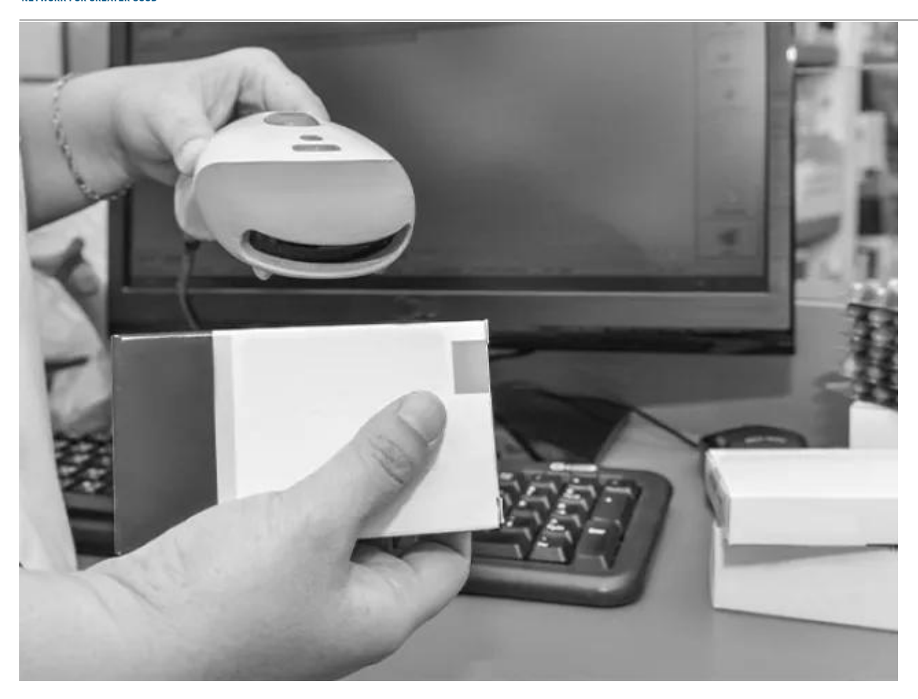
U.S. DSCSA 2023 Readiness: Rapid Path to Upgrading for EPCIS

Learn how to activate your TraceLink Product Track solution for DSCSA-compliant EPCIS data exchange.