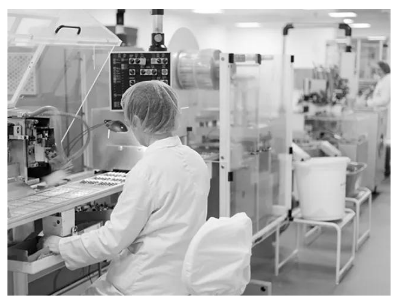
DSCSA 2023 Requirements and the Capabilities You Need to Keep Up

The final phase of DSCSA traceability requirements go into effect on November 27, 2023. View More