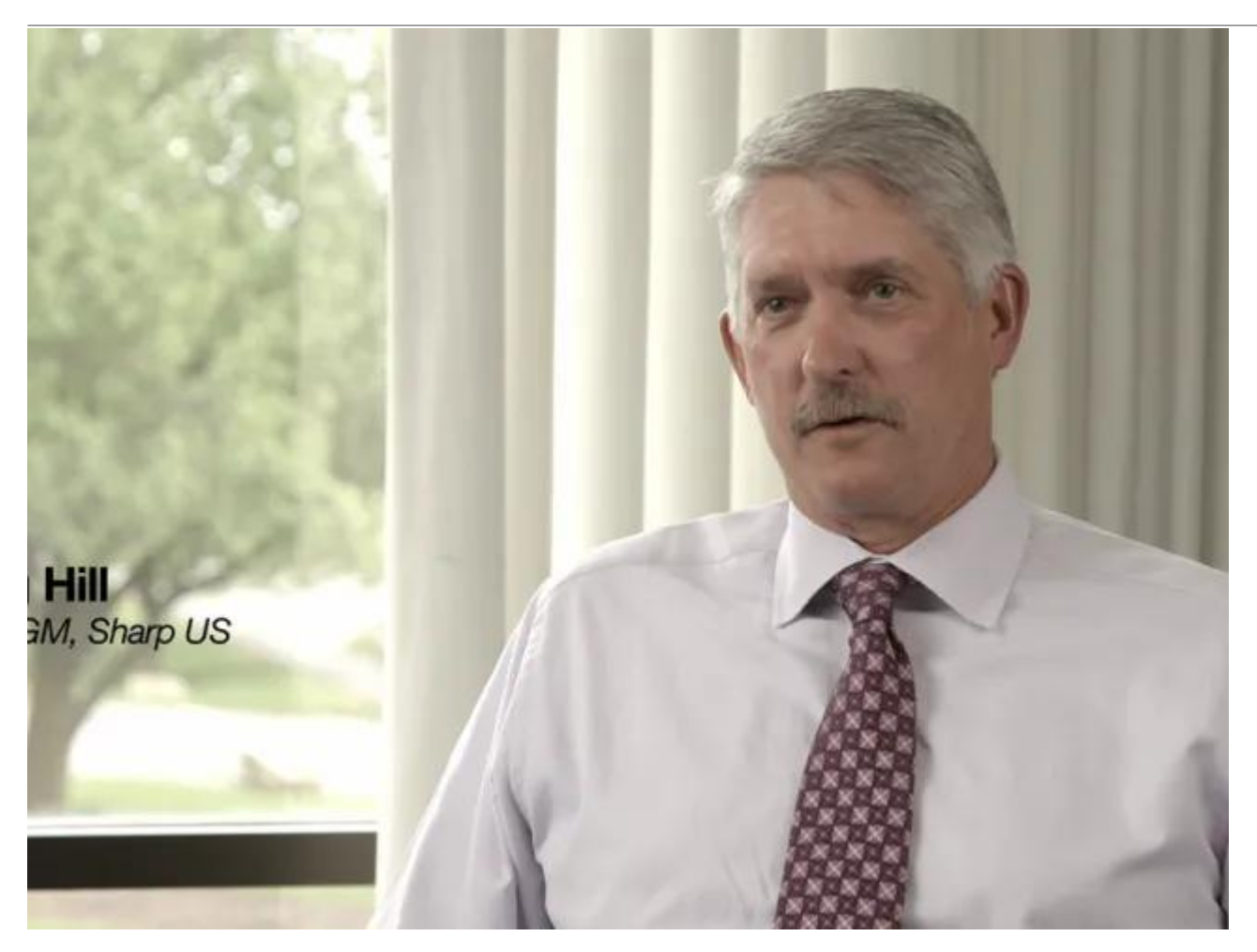
Phase 3 Planning: Serialization from the Sharp Packaging Perspective

If you're a Phase 3 pharma company, serialization will be part of your strategy. Watch Sharp SVPs discuss how they approach serialization.