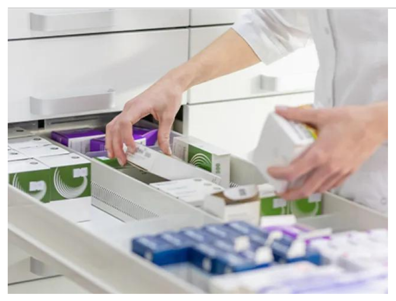
FDA DSCSA Enforcement Update: Everything You Need to Know

The FDA has announced a 12-month stabilization period for the final set DSCSA compliance requirements. Find out what that means for the industry in this webinar.