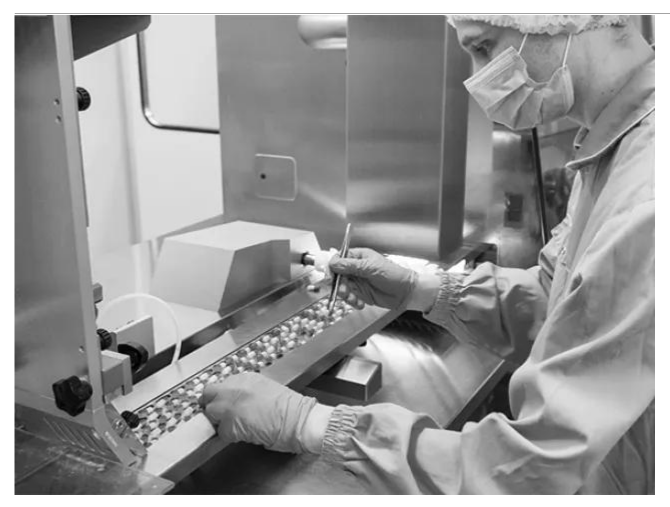
Pharmaceutical and Healthcare Leaders Gather at FutureLink 2023 to Lay Foundation for End-to-End Supply Chain Orchestration

Nearly 200 pharmaceutical industry business leaders descended on Boston for FutureLink 2023. Read this article to get the insights shared at the event.