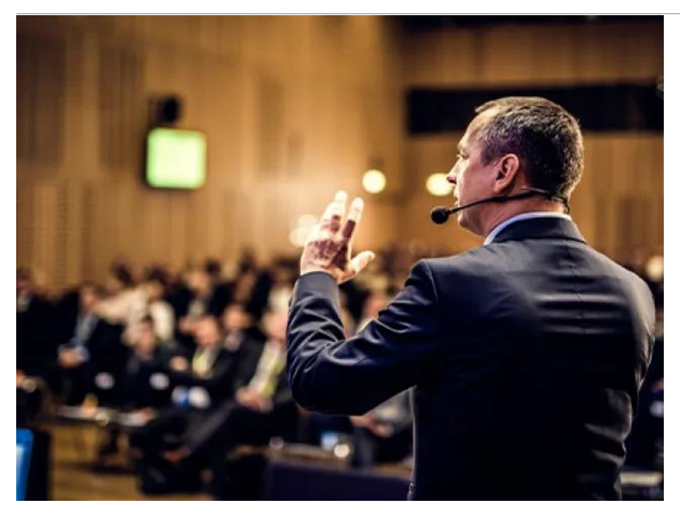
Pharmaceutical Industry Leaders Accelerate DSCSA Compliance, Lay Foundation for End-to-End Supply Chain Visibility at FutureLink 2023

FutureLink attendees collaborated with peers from across the industry to meet DSCSA deadlines, tackle drug shortages, and advance end-to-end-supply chain visibility. View More