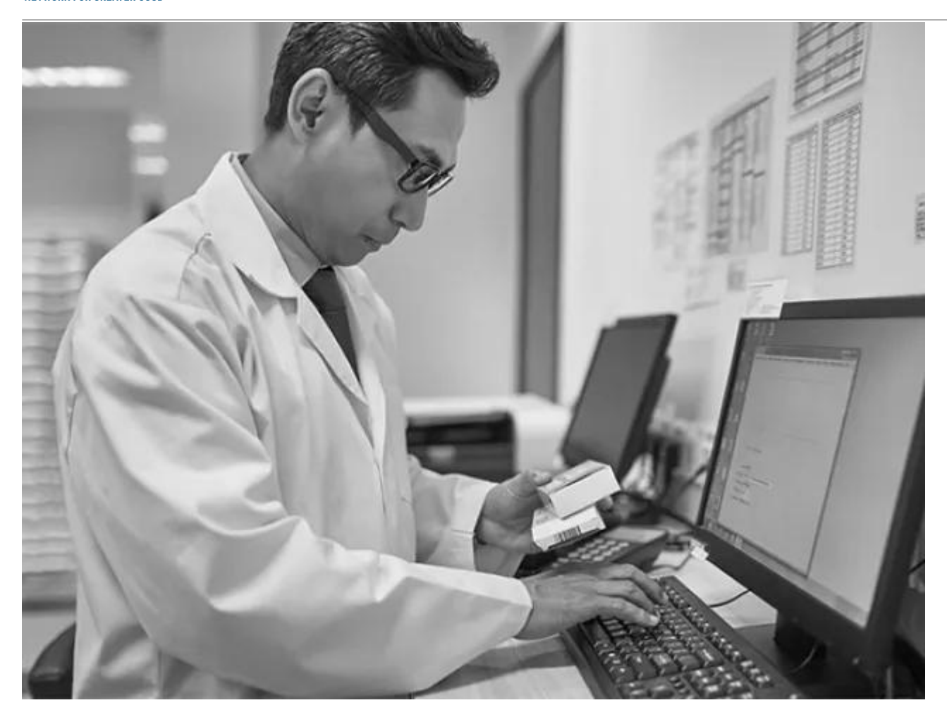
Why Merz Therapeutics Chose TraceLink for DSCSA Compliance

Find out how TraceLink makes DSCSA compliance fast, simple, and easy. Watch the video and contact TraceLink to learn more!