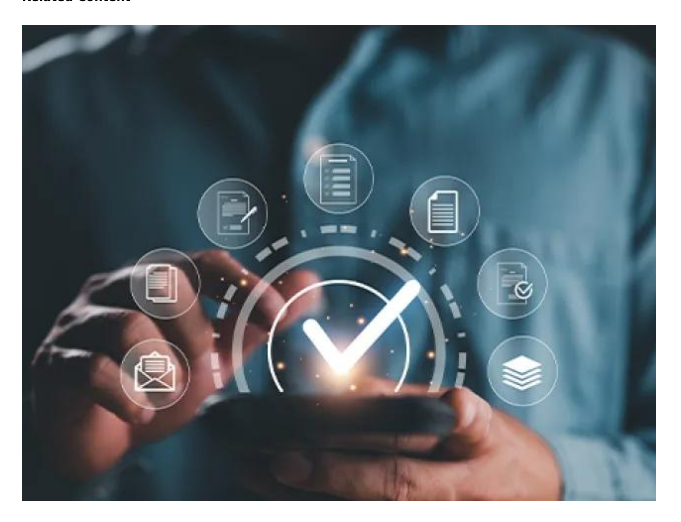
DSCSA Exceptions: Expert Strategies for Troubleshooting and Resolution

DSCSA exceptions can disrupt the pharma supply chain. Watch this webinar to learn how to resolve compliance exceptions 64% faster.