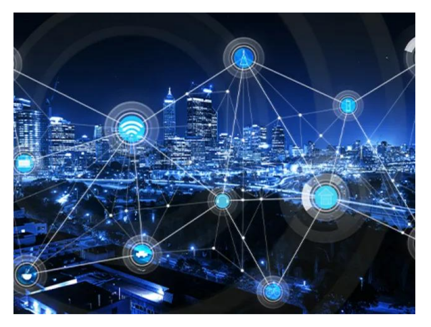
Boost Manufacturing On-Time Performance by Integrating with 100% of Your Suppliers: 3 Key Takeaways

Get the key takeaways from our informative webinar on how to quickly and cost-effectively integrate with 100% of your suppliers.