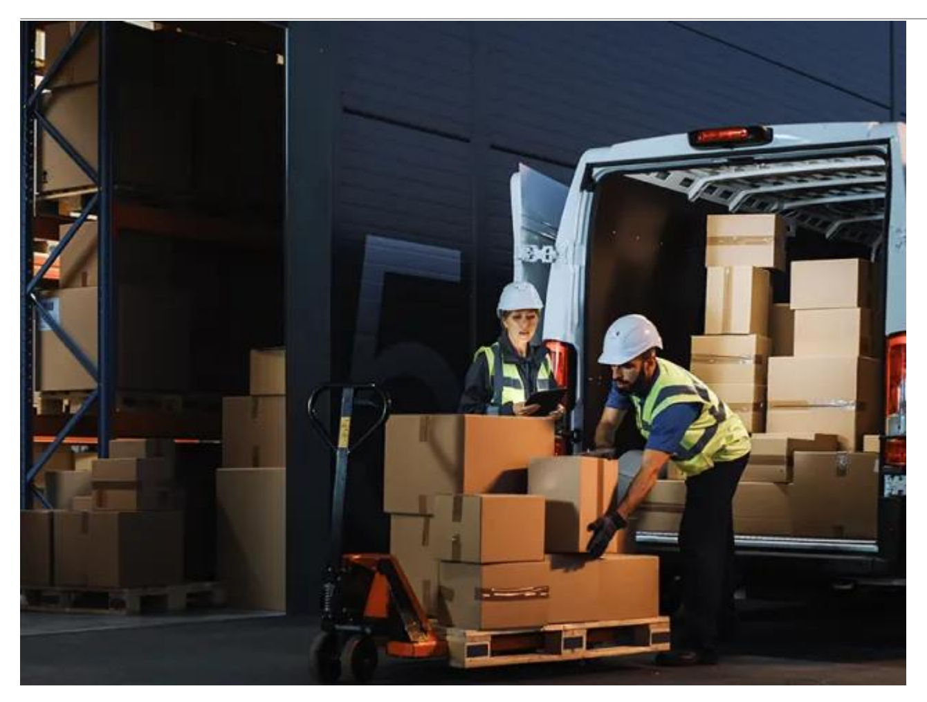
Integrate with 100% of Your 3PLs with MINT for Logistics

Learn how TraceLink MINT enables fast, simple, and cost-effective integration with all of your 3PLs.