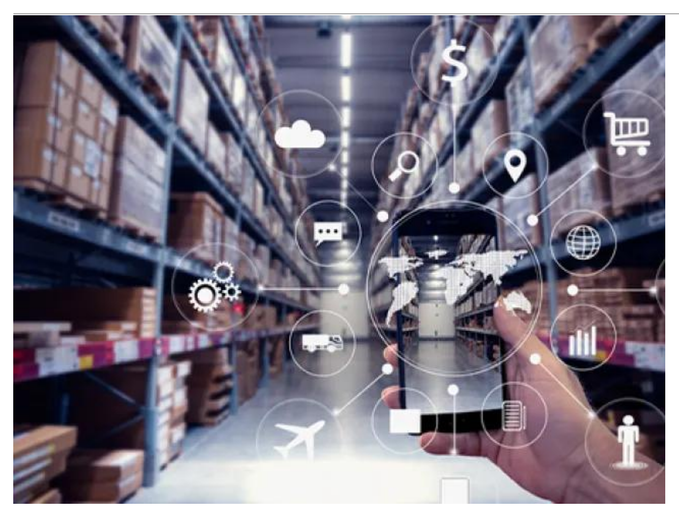
Boost Manufacturing On-Time Performance by Integrating with 100% of Your Suppliers

Watch this on-demand webinar to see how TraceLink MINT enables fast, simple, and cost-effective integration with 100% of your CMOs and suppliers.