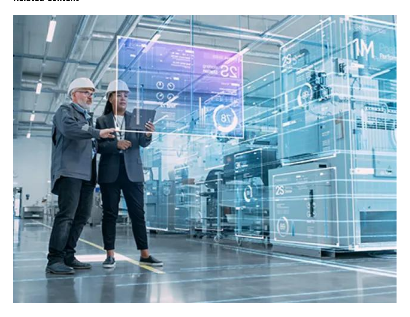
Drop Shipments, 340B, and Returns: Unpacking the Complexity of Shipments Under DSCSA

The U.S. DSCSA creates new logistical challenges for drop shipments, 340B and returns. See why a network-based platform is key to addressing these obstacles.