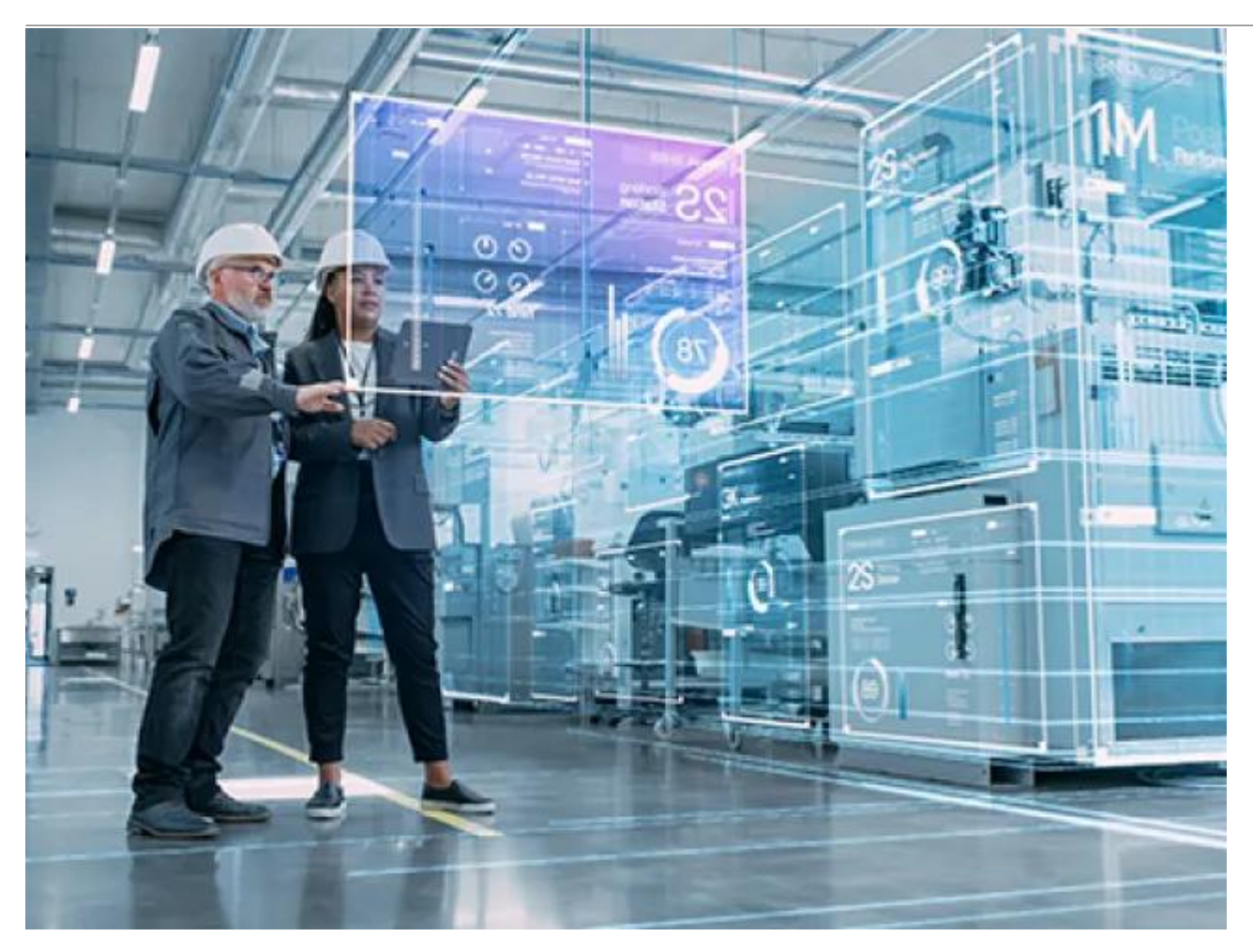
Drop Shipments, 340B, and Returns: Unpacking the Complexity of Shipments Under DSCSA

The U.S. DSCSA creates new logistical challenges for drop shipments, 340B and returns. See why a network-based platform is key to addressing these obstacles. View More