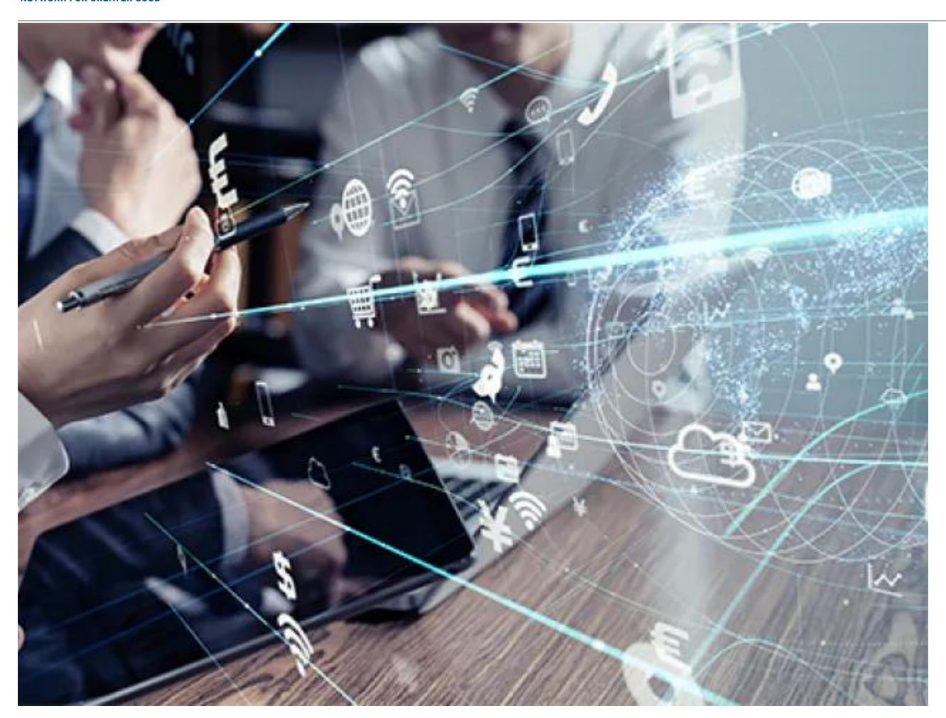
TraceLink: Leading Industry Readiness with More than 26,000 Companies Already Enabled for DSCSA Compliance

TraceLink leads DSCSA implementation with 26,000 companies enabled. View More