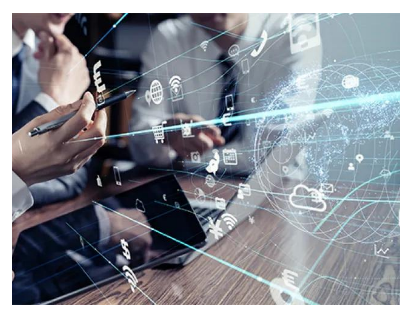
340B Under DSCSA: How to Close the Gap Between Data Flow and Product Flow

The impact of DSCSA on 340B products has been a constant source of confusion. Read this Q&A for insight on how to compliantly manage 340B shipments.