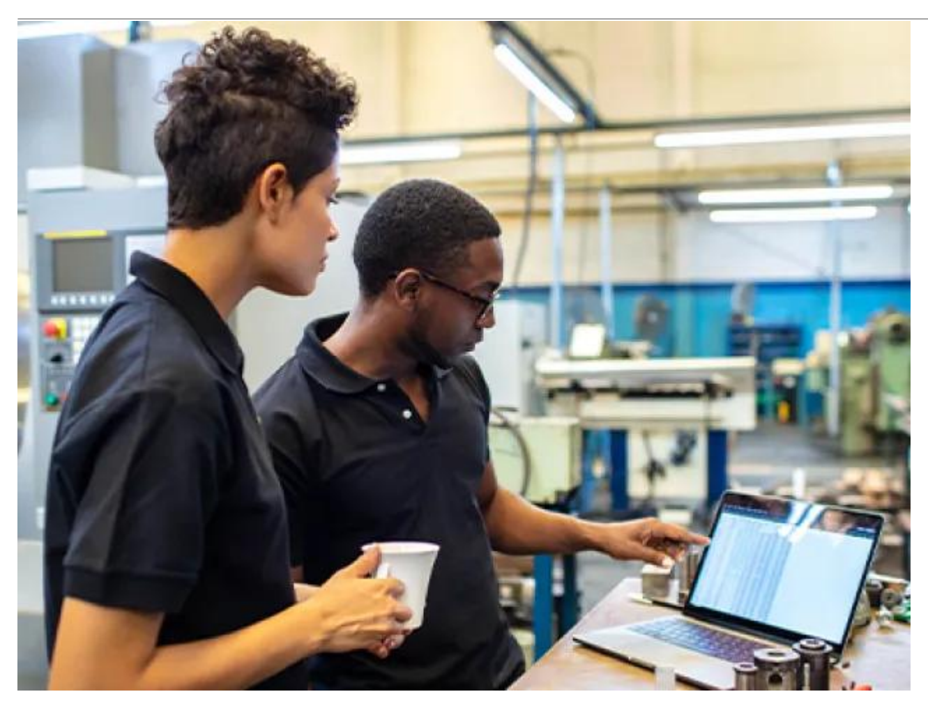
340B Under DSCSA: Why a Network is Critical for Efficient 340B Shipping and Receiving

The industry has yet to agree upon a common model for handling 340B product under DSCSA. Watch this webinar for a deep dive into some of the approaches. View More