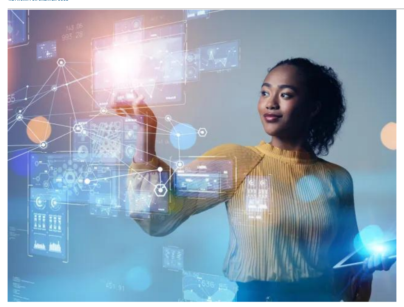
Transforming Supply Chain Orchestrations With Opus Solution Environment (OSE)

The Opus Solution Environment (OSE) empowers organizations to rapidly adapt and innovate by allowing Opus Solution Designers, regardless of coding skills, to create robust solutions without code, while also supporting advanced configurations with JavaScript for greater flexibility.