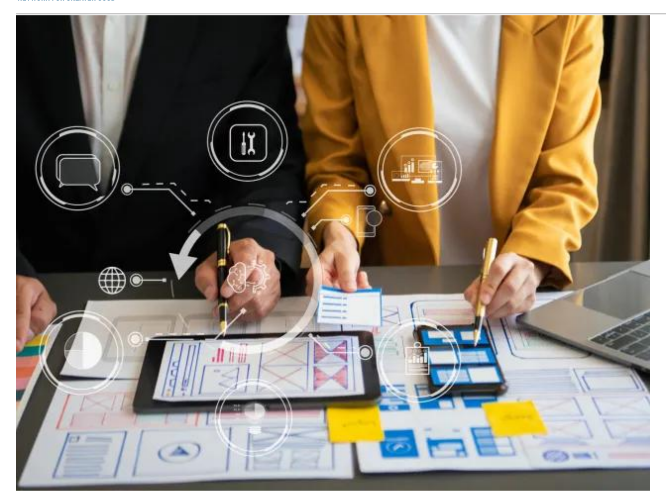
Get Started Designing on the Opus Platform With Opus Anthem

Anthem is TraceLink's Design System that establishes consistent design conventions across the Opus Platform, allowing designers to quickly create solutions that meet various business and user needs.