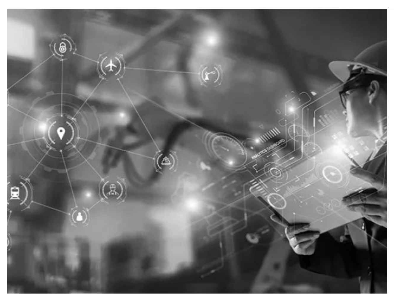
DSCSA 2023 Compliance for Drug Manufacturers Solution Brief

DSCSA 2023 introduces significant regulatory compliance challenges and new operational complexities for drug manufacturers.