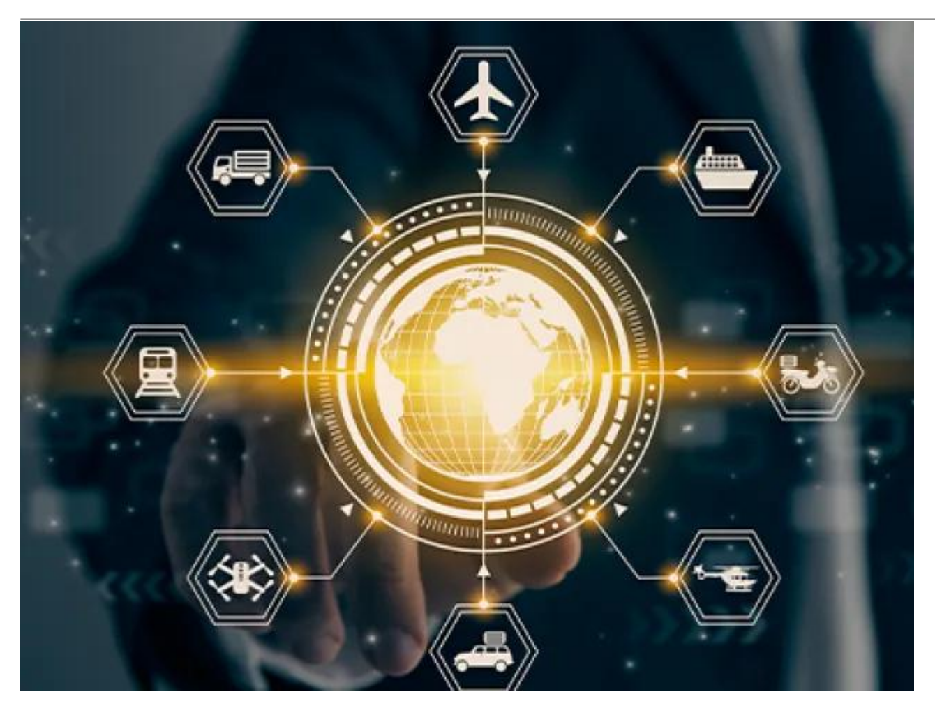
FutureLink Boston 2024 Highlights: Orchestrate Your End-to-End Supply Chain with TraceLink

FutureLink Boston 2024 shined a light on life sciences and healthcare leaders driving digital supply chain transformation. Watch the video for highlights! View More