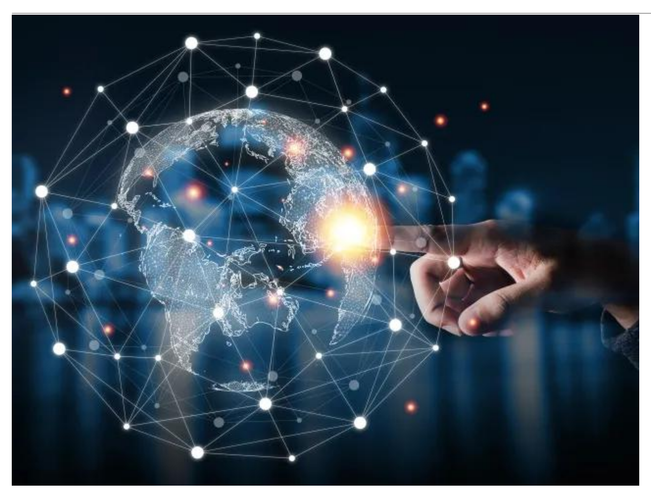
TraceLink Continues Rapid Growth and Completes Transformation into Platform Company in 2024

TraceLink, the only no-code network digitalization platform for supply chain orchestration, announced a landmark year of growth and innovation. Driven by rapid adoption of OPUS, its end-to-end orchestration platform, TraceLink and its partners are shaping the future of digital supply chain transformation.